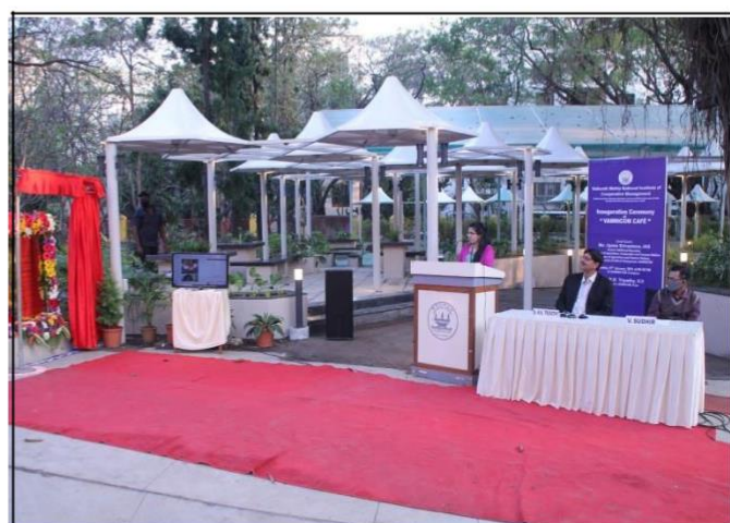
Inauguration of VAMNICOM Café (28th January 2021)