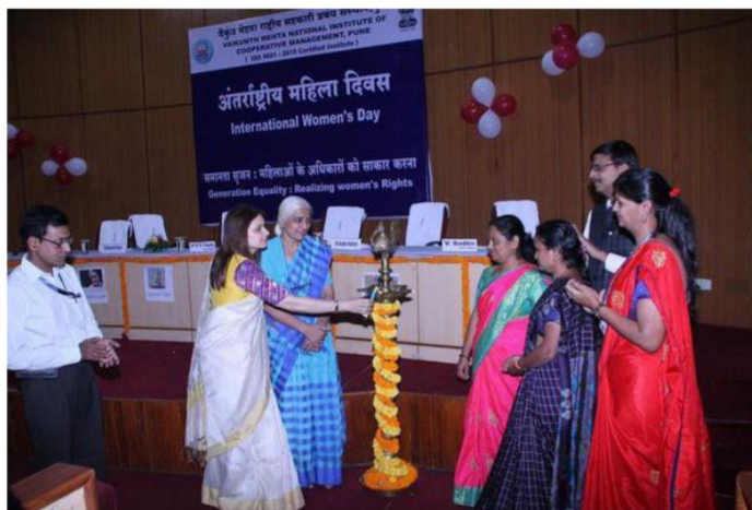
International Women's Day (11 th March 2020)