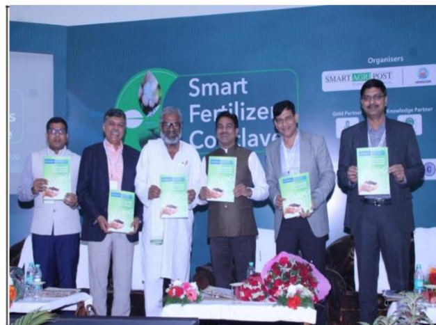
National Workshop on Smart Fertilizer Conclave (28-29 February 2020)