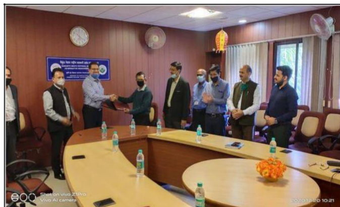
MOU between VAMNICOM and MNGI (20 th December, 2020)