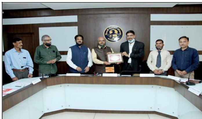
MOU between VAMNICOM and YCSRD, Kolhapur (18 th December 2020)