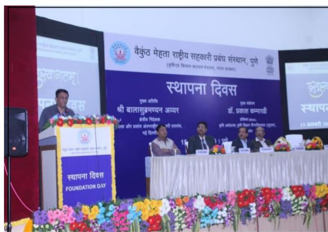
VAMNICOM Foundation Day (15th January 2021)