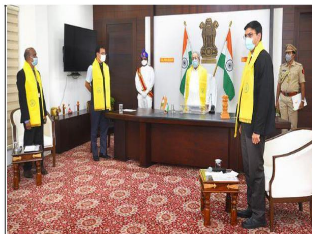
PGDM-ABM Convocation (24th January 2021)