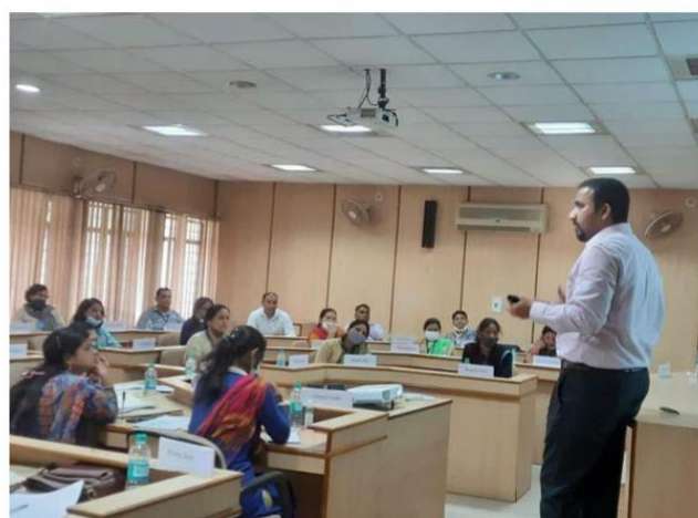
Capacity Building Program at VAMNICOM (19-23 January 2021)