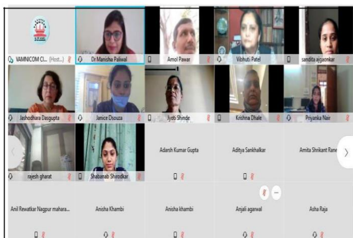
National Level Program on Gender Budgeting (21-23 JANUARY, 2021)