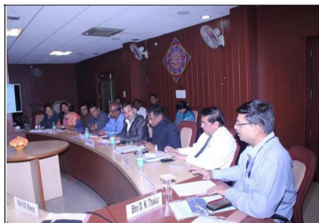
View of the Expert Committee Meeting for Restructuring PGDBCM (14 th February 2020)