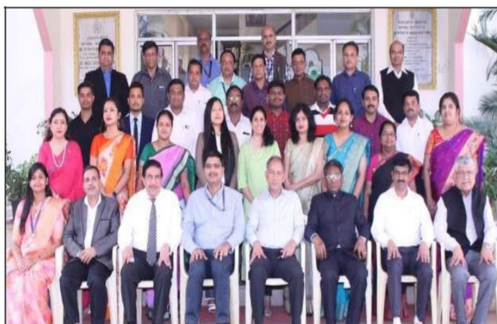
Chairman and Members of the Expert Group on rd