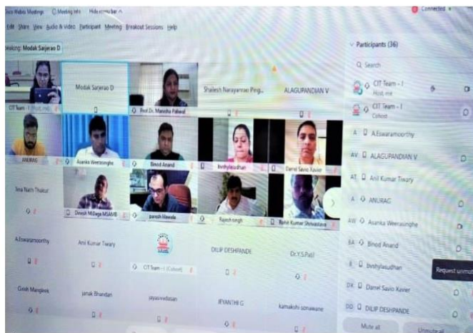
Online Inauguration of 54th Batch of PGDCBM (24th November 2020)